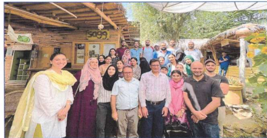
Eco-Entrepreneurship Session: Field Visit to Sagg Ecovillage

[Signature] Director Centre for Innovation & Entrepreneurship Development (CIED) Islamic University of Science & Technology Awantipora, Kashmir