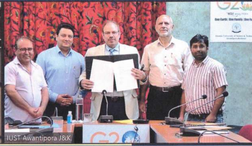
MoU with MegaAI Lab (MAILAB) Seoul, Republic of South Korea