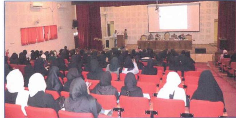
Visit to Government Degree College Anantnag for Women's Entrepreneurship Awareness Camp