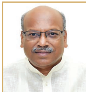
Sanjay Shamrao Dhotre Minister of State for Human Resource Development

India aspires to become a 5 trillion dollar economy in a near future. To reach this mark, it needs to evolve system and mechanisms to convert the present demographic dividend into high quality technical human resource, capable of doing cutting edge research and innovation, and deep-tech entrepreneurship. At this juncture, the MHRD's Innovation Cell and AICTE have brought out the 'National Innovation and Startup Policy 2019' for students and faculty.