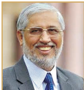
Anil D Sahasrabudhe Chairman, AICTE

I am very happy to see that the detailed guidelines have been issued by Ministry of Human Resource Development on National Innovation and Startup Policy for students and faculties of higher education institutions which further strengthens the Startup Policy released by All India Council of Technical Education in November 2016 from Rashtrapati Bhawan, just after few months of Startup action plan announced by the Government of India in January 2016.