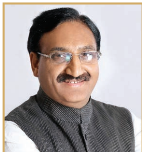
रमेश पोखरियाल 'निशंक' मानव संसाधन विकास मंत्री

स्टार्ट-अप इंडिया भारत सरकार की एक प्रमुख पहल है, जो नवीन आविष्कारों को हाथ में लेने, सहायता और प्रोत्साहनों के वित्त पोषण, उद्योग-शैक्षणिक भागीदारी और इन्क्यूबेटरों के बुनियादी स्तंभों पर आधारित है।