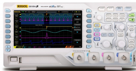
RIGOL Digital Oscilloscopes