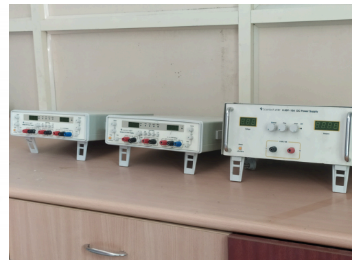
Digital Power Supply