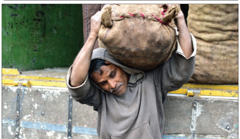
A man lifts a bag of whole walnuts from a shop for preparing walnut giri manually as part of refugees' livelihood in winters. Almost all the families are involved in this job, which brings the only source of income to them during the cold season.