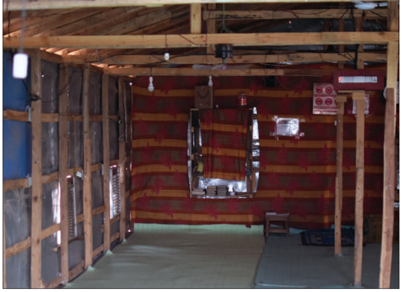
Interior of one of the sheds in the camp. The refugees have to pay Rs 1,000 as monthly rental charges. They spread rags on the ground to sleep. The sheds are mainly built of wooden poles and old steel sheets, while roofs are formed of foam sheets.