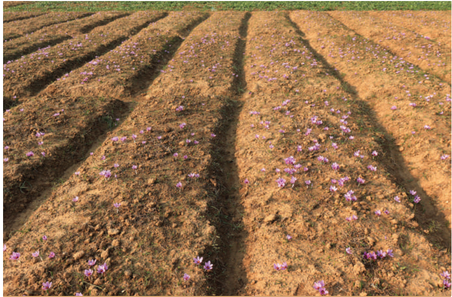
Saffron is used in seasoning and as a colouring agent of food. The price of saffron is between Rs 150 and 250 per gram. Because of being expensive, saffron is also known as Red Gold. Its harvest period is between ending days of October and starting days of November.

Pampore is one of the few places in the world, where Saffron—world's most expensive spice—is grown. That is why, it is also known as the Saffron Town of Kashmir. It is an ancient historic town situated on the western side of River Jhelum on Srinagar-Jammu National Highway in Jammu and Kashmir. It is also famous for Shirmaal roti, historical monuments like Shrines of Hazrat Khwaja Masood Wali, Ahad Sahab Dalvan, Ahad Sahab Gangi and others, and some wetlands like Manibagh and Chaetlam.