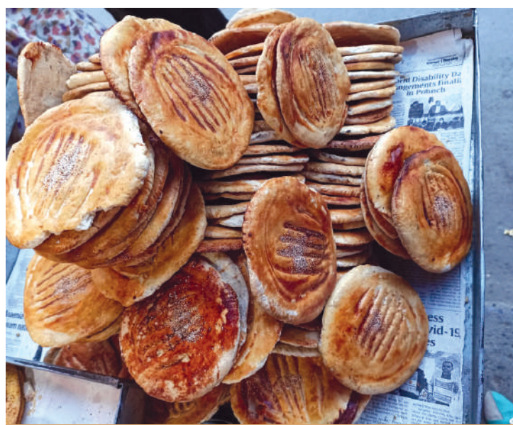
Sheermal Roti is a famous bread of Pampore. It is exported from Pampore to various places for special occasions like Eid, weddings and so on.