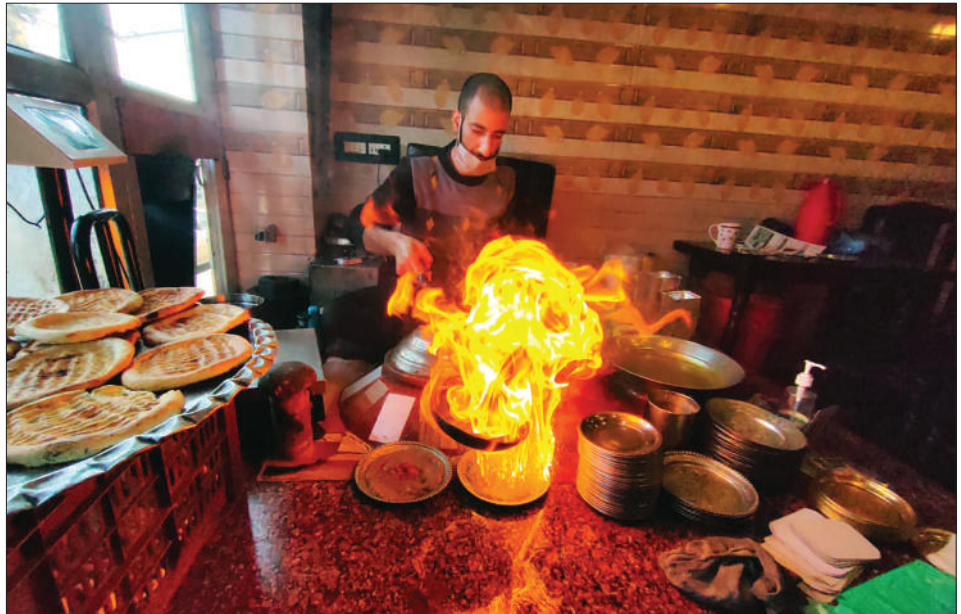
A plate of Harrisa is garnished with hot oil at an outlet in Srinagar.