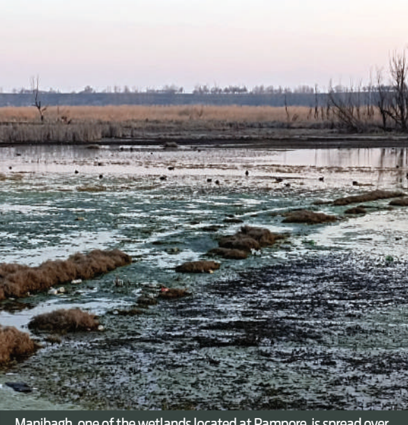
Manibagh, one of the wetlands located at Pampore, is spread over two square kilometers of land and marshes.