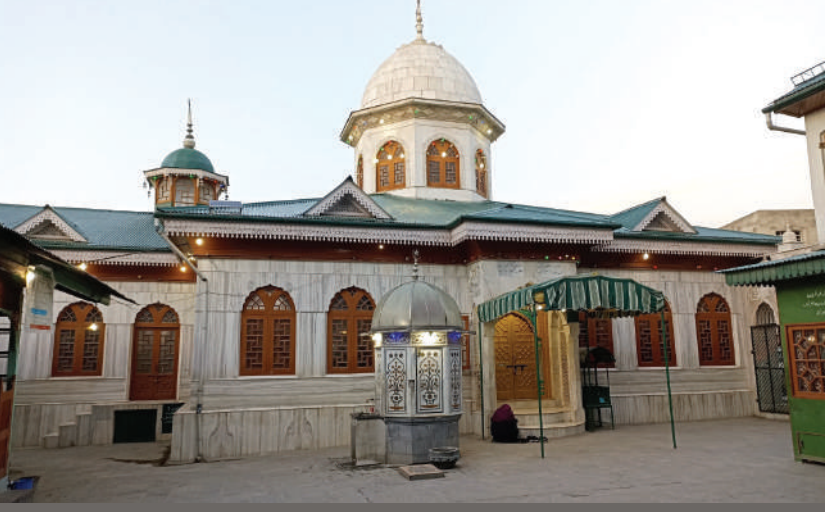
The Shrine of Hazrat Khwaja Masood Wali (RA) popularly known as Khuja Sahab at Namblabal in Pampore. During the days of Urs, majority people from Pampore and adjoining villages do not consume mutton or chicken.