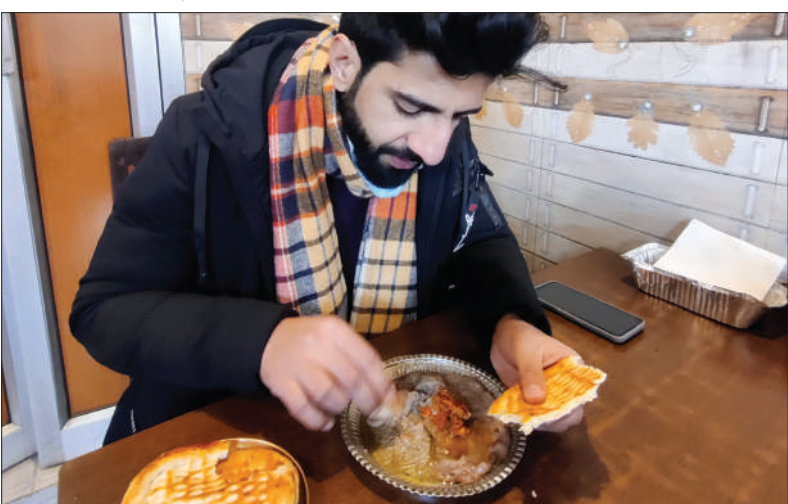
A local relishing Harissa with flat bread.