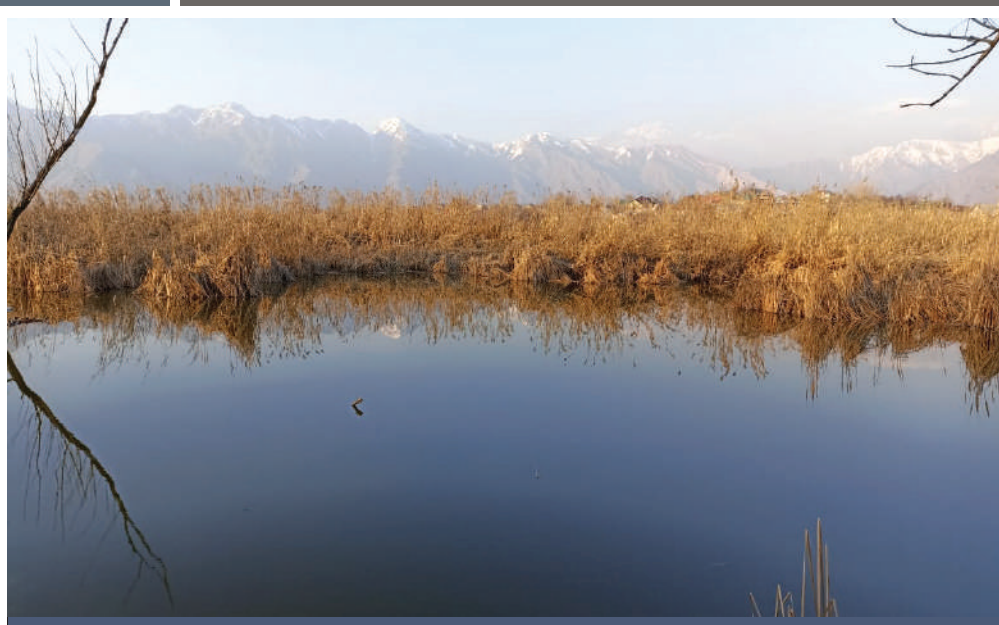
Chaetlam wetland is situated two kilometers away from the National Highway. During winters, migratory birds from several locations including Siberia flock this wetland.