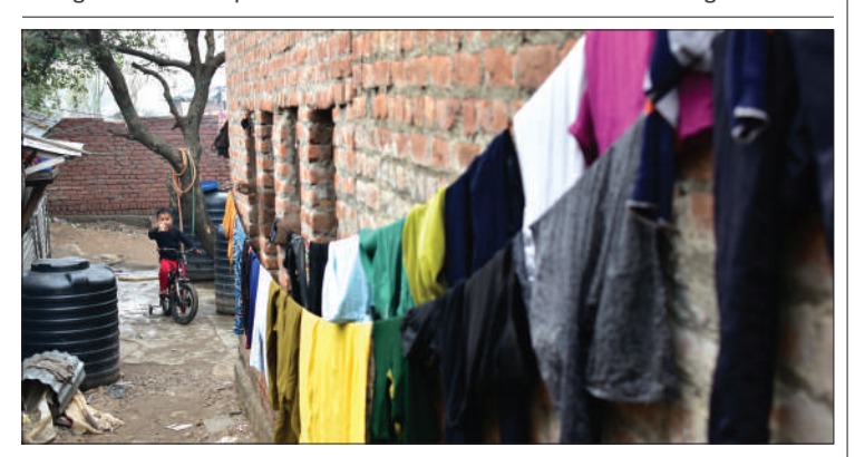
A child waves to the camera while riding his bike inside the camp besides a clothing line.