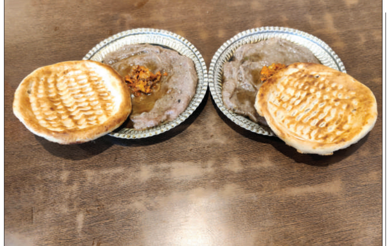
Harissa is served hot in small plates with traditional flat bread.