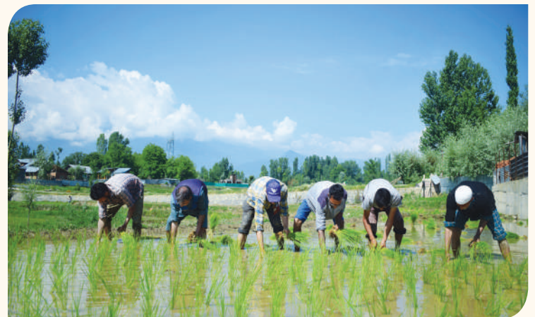
Farmers sowing paddy saplings during the sowing season in June in Budgam district.