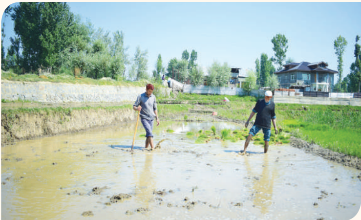
Farmers plucking out weeds and levelling paddy field before sowing the saplings in one of the villages in Budgam.