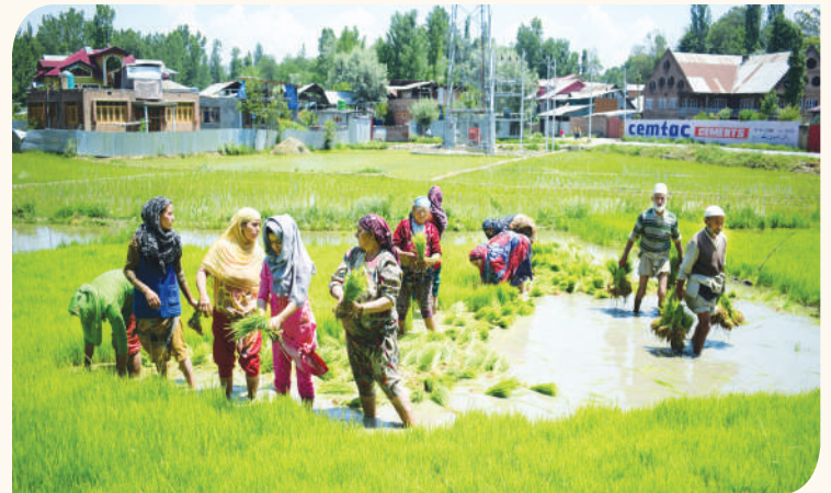
Women pulling out rice saplings from a small piece of land to plant them in larger paddy fields.