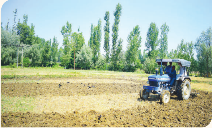
Farmers ploughing paddy fields with tractors ahead of planting rice saplings in central Kashmir's Budgam district.

W ith onset of summer season in the Valley, Kashmiri farmers spend most of their time in farm-lands. They begin the paddy cultivation with sowing rice saplings in the paddy fields spreading from low lying areas to upper reaches of Himalayas. The villagers participate with enthusiasm and help each other in the fields in every task from sowing saplings and plucking out weeds to harvesting the crops.