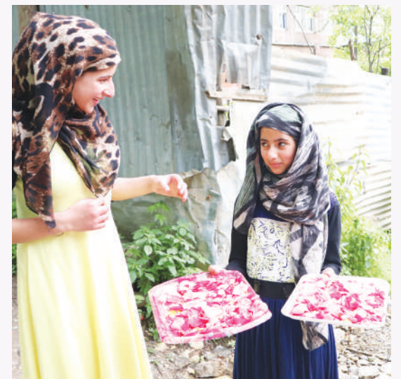
Girls holding trays with rose petals to shower over the graves.

Meanwhile, a group of villagers lead by the Imam-e-Masjid (one who leads prayers in Mosque) enter the graveyard holding baskets full of chapattis to distribute them among the children. After distribution, people move towards the white lilies, beneath which their loved ones are laid to rest.