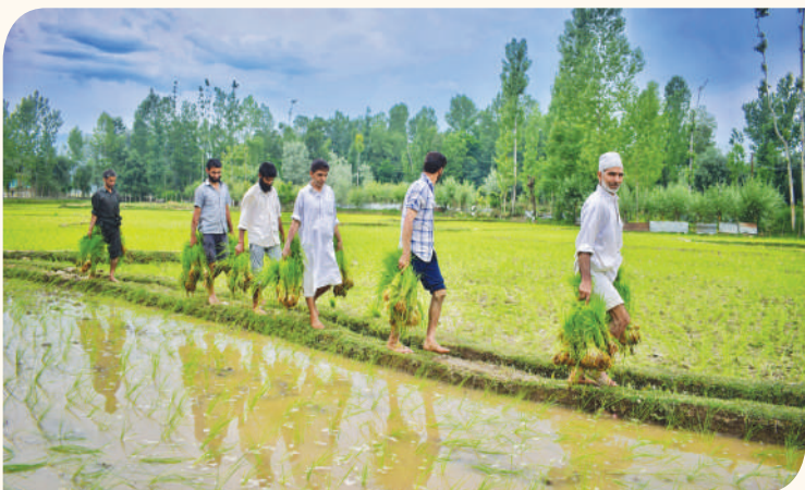
Farmers carrying rice saplings to be sown in the paddy field.