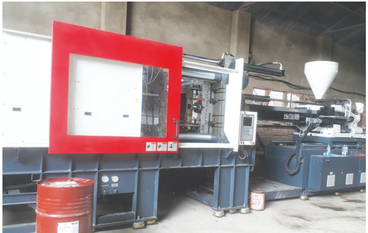
Plastic injection moulding machine in Supertherm factory at Shalteng industrial estate.