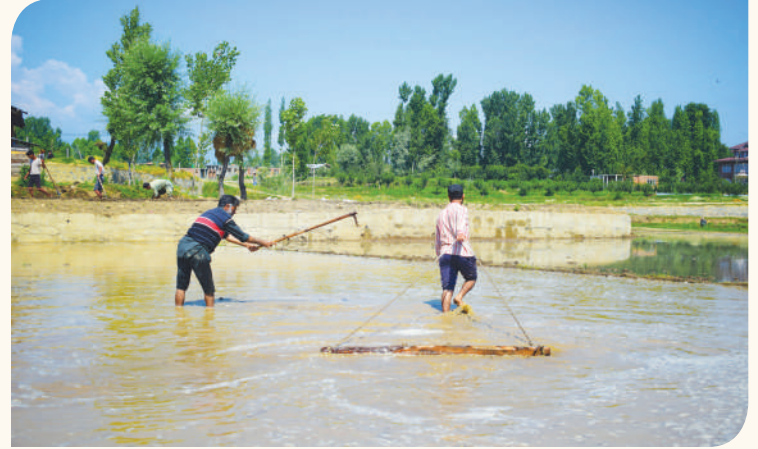
Paddy fields are being filled with the required amount of water. The incessant rains usually delay the process of sapling sowing, which even hits the productivity.