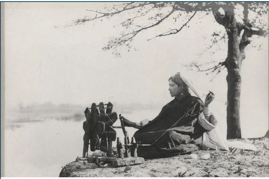
Yander katun : This is an antique Kashmiri postcard which depicts a beautiful Kashmiri young girl, spinning cotton called ' Yander katun '. The picture is taken in 1900s and describes how beautifully she has chosen a bhot ; meaning the banks of river or a lake to enjoy her daily chores.