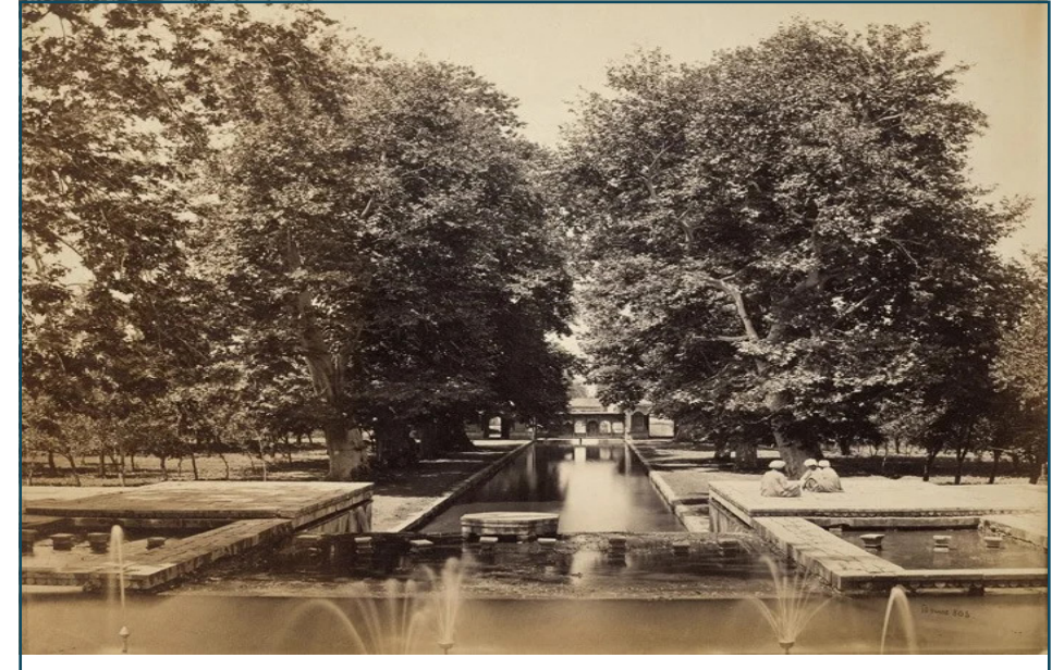
Shalimar Garden: This picture of Shalimar Garden, built by emperor Jahangir, depicts the beauty and architecture of the garden is a bliss in solitude today as well.