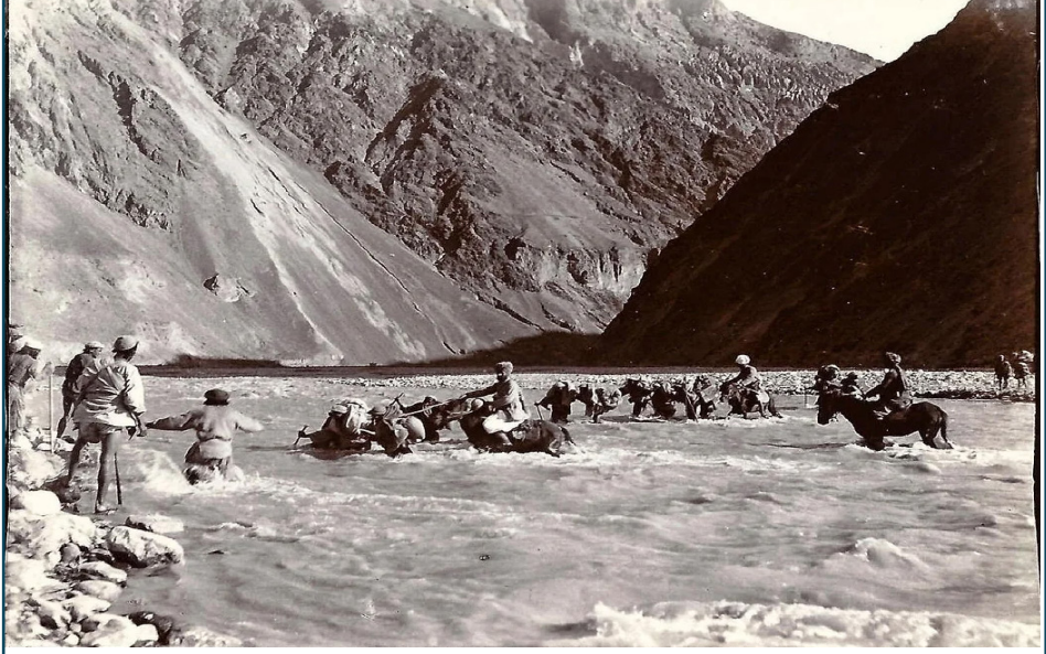
Shikar Party : This postcard of a ' shikar party ' (going for a hunt) was clicked in 1903 and captures how khojas or elites used to cross waters on horses for hunting.