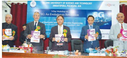
Courseware for Engineering and Technology students being released during the workshop on 5G communication technology on September 24.