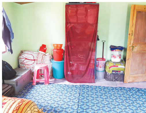
Rented accommodation for students at Chhanapora, Srinagar.

"It is quite difficult to stay as a paying guest as we have to manage everything by ourselves, be it