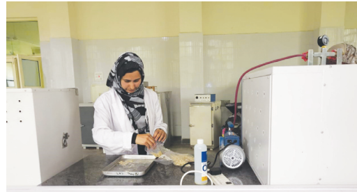
A student performing experiment in the Food Technology lab.

He adds that besides providing quality man-power, the department has also been at the forefront of disseminating information about food safety and standards "for the benefit of the community."