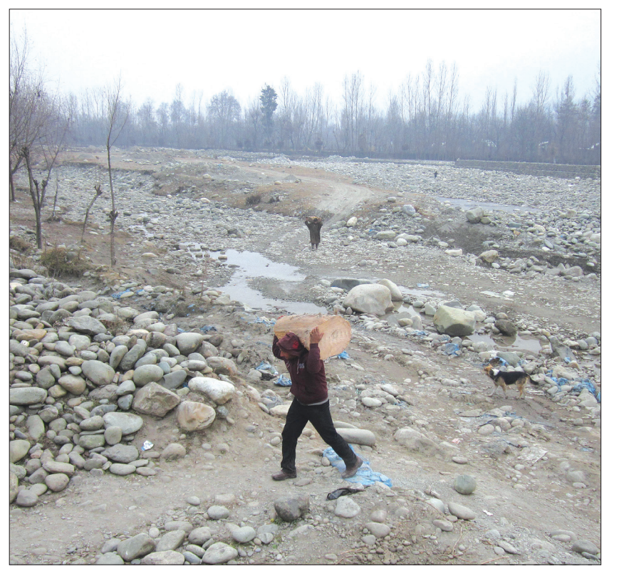
TIMBER SMUGGLERS CARRYING LOGS THROUGH A DRIED UP STREAM IN KANGAN AREA.

"Forests are assets of a nation and they need to be preserved. The importance of the forests has not only been highlighted by government and non-governmental