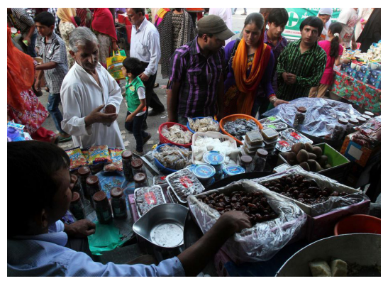
A shopkeeper selling Pakistani products at Hari Singh High Street in Srinagar.

Many prominent names from Pakistan's fashion