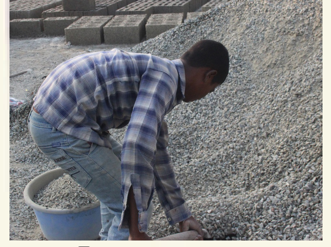
A boy working in a brick manufacturing plant at Dialgam.