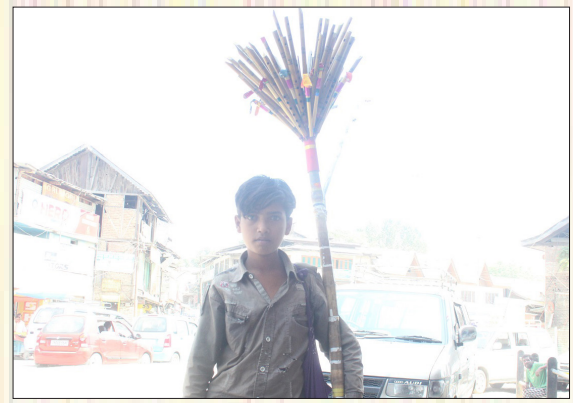
A child sells flutes at Mehandi Kadal.