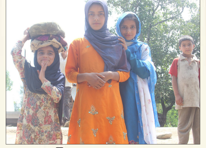
Children carrying cobblestones to a nearby construction site at Vailoo