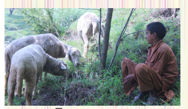
13-year-old boy of Daksum looks after his flock of sheep.