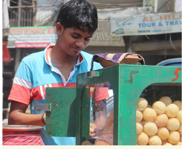
A boy selling crisp spheres to make both ends meet at Lal Chowk.