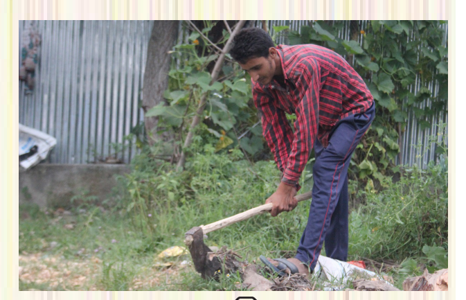
A boy cutting wood at Krangsoo.