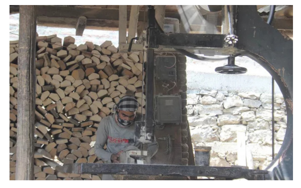
A worker cutting raw willow into pieces at a cricket bat factory at Sangam in Anantnag.

The devastating floods damaged Kashmir willow trees that are used to manufacture cricket bats, thus affecting the bat industry of Meerat—the manufacturing hub of cricket bats. Many cricket bat manufactur-