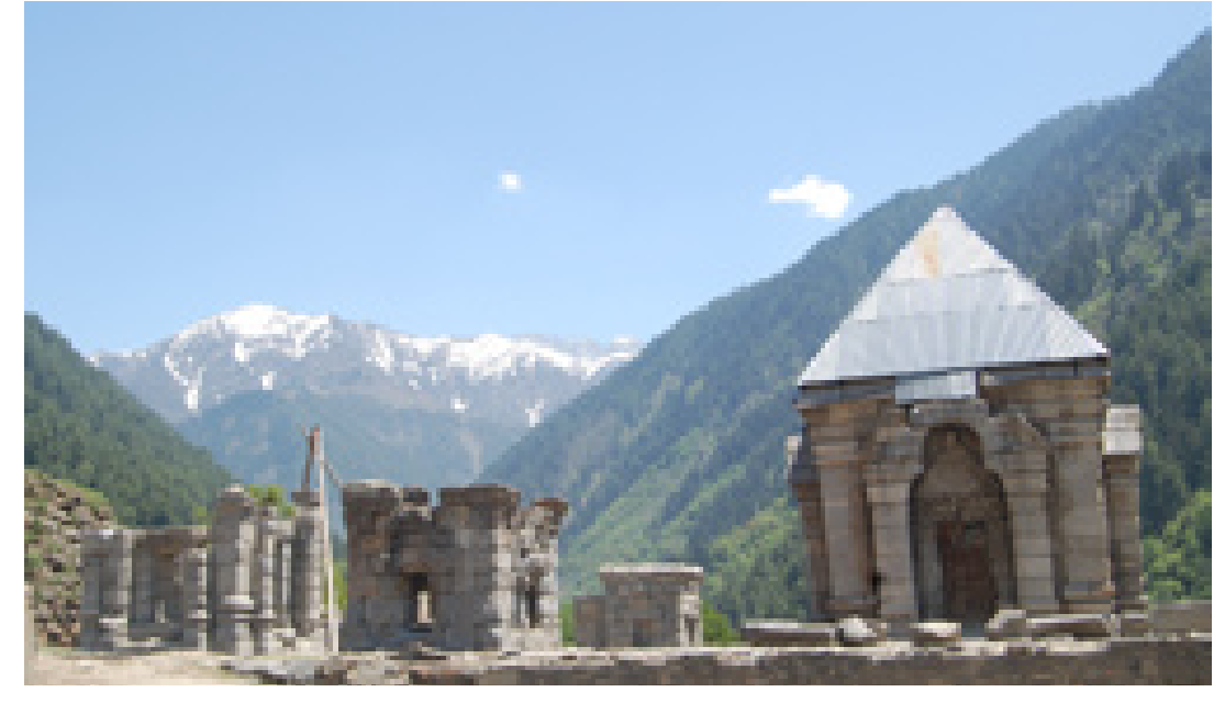
Ruins of the historic temple complex at Nara Nag.

Nara Naglies some 86 kilometers away from the IUST. It also lies eight kilometers to the east of Wangat, a small hamlet on Srinagar-Leh national highway. It is one of the most preferred adventure tourism destinations in the valley. Foreign tourists particularly prefer this place for trekking