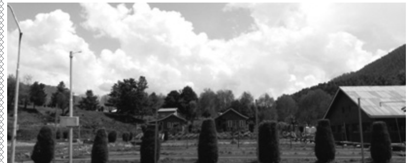
Kokernag Fish Hatchery

"A couple of years back, the floods caused by cloudburst damaged the whole