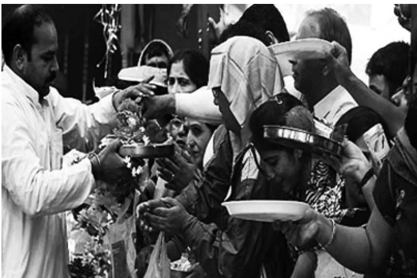
Devotees collecting Prasad from a Muslim care taker of Shiv Lingam at Gandarbal cave temple in north Kashmir.

Both local Hindus and Muslims contribute for the maintenance of the shrine by donating alms. “With majority of population in the village being that of Muslims, most of the charity comes from us for the development of this shrine. However, pilgrims and devotees also pay alms to the Shiva