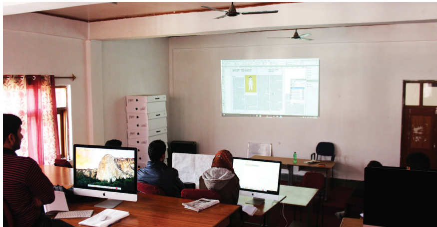
Media Lab of DJMC, IUST