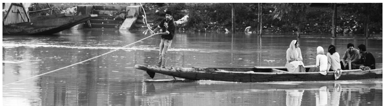
Seerbagh residents crossing River Jhelum by boat.

Locals say, they feel more insecure after the sunset when boat usually turns off, especially in winters. "In that situation, we have to cover a long distance through alternate routes to reach home," says Shazia Bashir, a 19-year-old student.