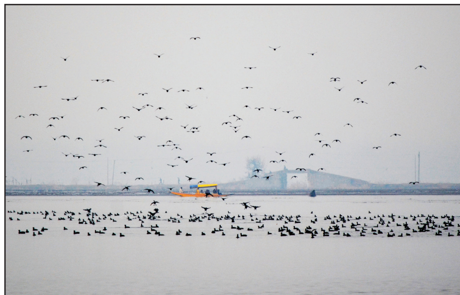
Migratory birds rejoicing in the waters of Dal Lake, Srinagar.

“This year, migratory birds of around seven lakh species have moved from various countries to the Valley”