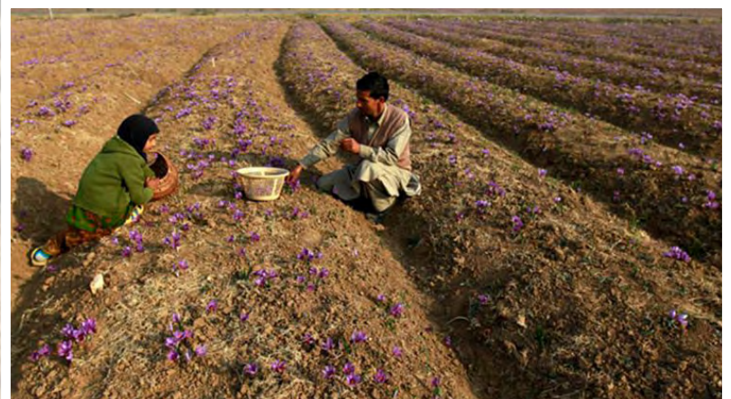
FILE PHOTO OF SAFFRON FARMERS IN J&K