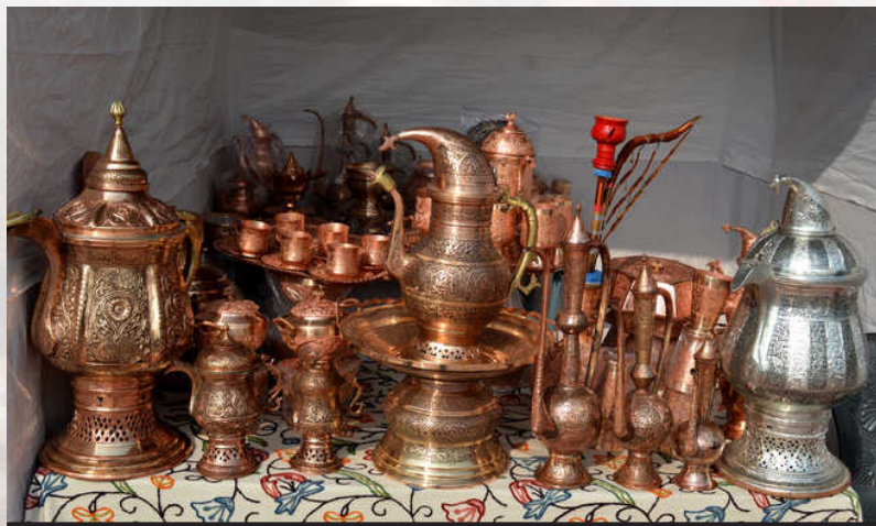
Kashmiri copper utensils on display at a shop in Srinagar.

In the contemporary times, people prefer decorative copperware for gift-