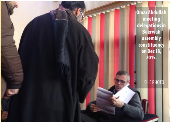
Omar Abdullah meeting delegations in Beerwah assembly constituency on Dec 18, 2015.